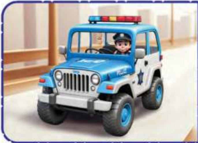
Police Patrol Vehicles