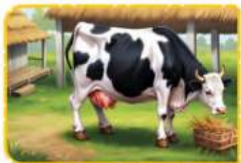
Cow — Shed