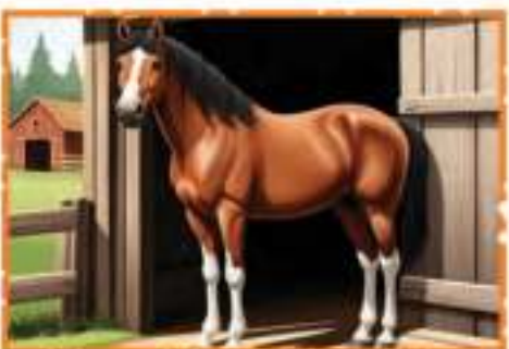
Horse — Stable