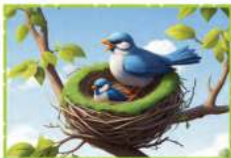
Bird — Nest