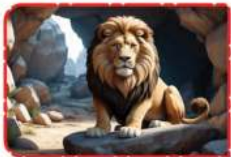
Lion — Den