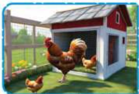
Hen — Coop