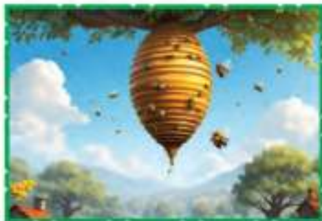
Bee — Beehive