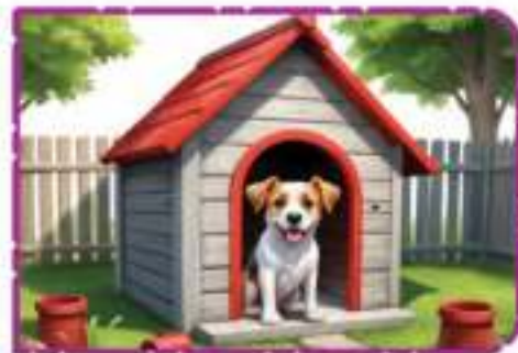
Dog — Kennel