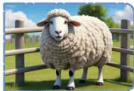
Sheep — Pen