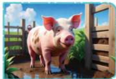
Pig — Sty